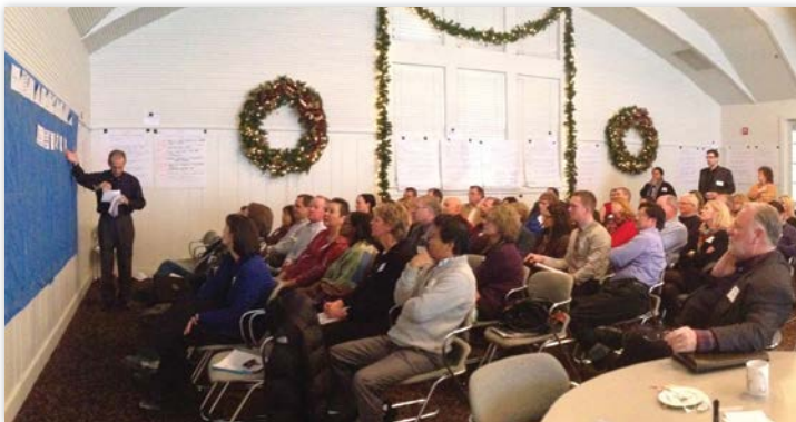
More than 50 attended the summit.

Treatment professionals, community organizers and representatives from state agencies attended the half-day session, which was led by a professional moderator and co-sponsored by Northstar and the Minnesota Department of Human Services. The results of the session will be communicated in a future issue of Northern Light .