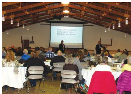
Nearly 100 people attended the 2018 Minnesota Conference on Problem Gambling.