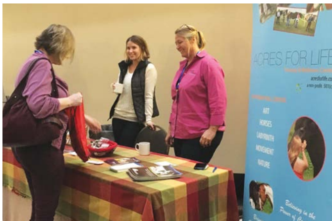
The conference provided opportunities for attendees to meet with various exhibitors.