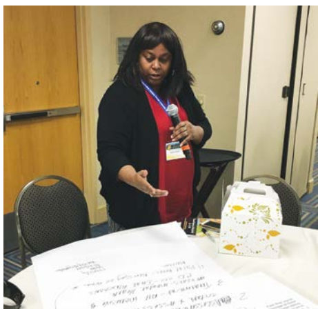
Small groups reported on their ideas about creating community change during lunch at the "World Café."